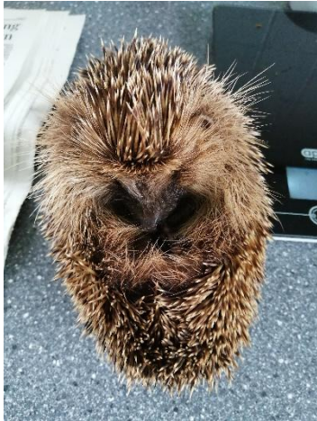
Snowdrop Released after hibernating

One was John. He was found on the 14 th April 2023 in a garden in Grantham. He was extremely cold with shallow breathing and very thin. John was an old hog shown by the ginger tone to his spines and hair - hogs turn ginger not grey. We warmed him up slowly over 24 hours, with a heat pad and fluids, he was given an antibiotic for a gut infection. But he was still losing weight. He has had his first dropping tested, but as usual with the first test, there is often nothing to be found. He died a few days later without really eating or drinking by himself.